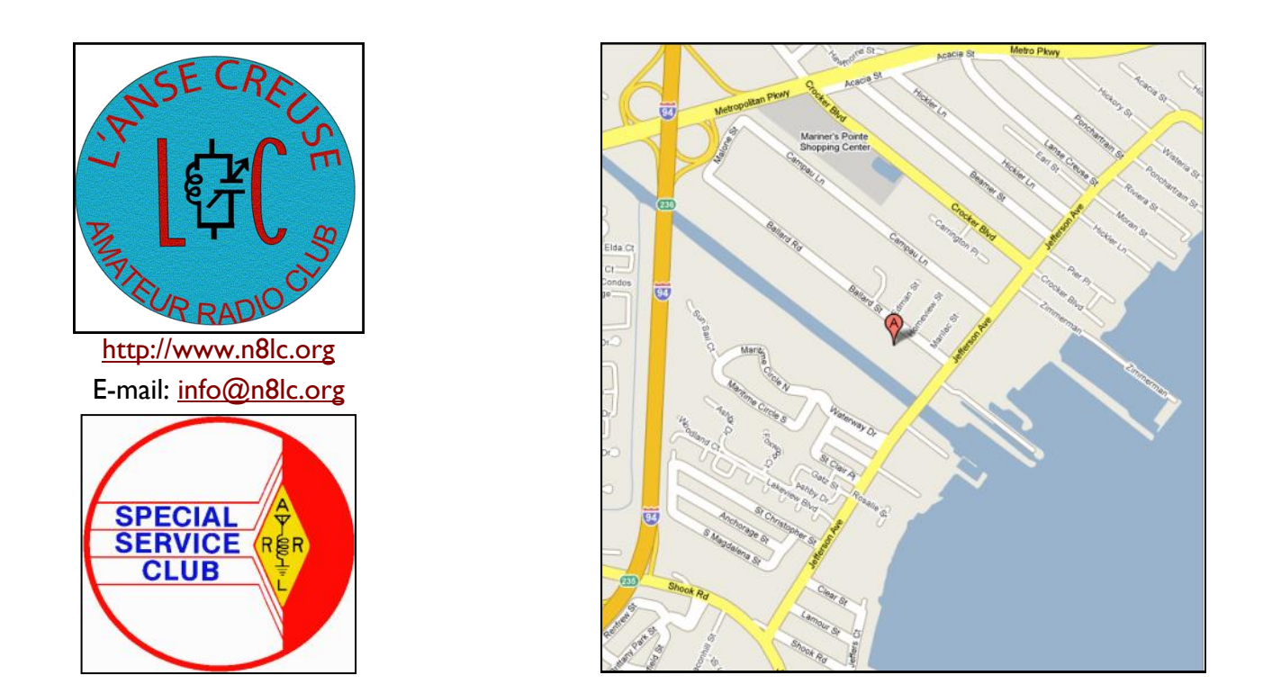
The L'Anse Creuse Amateur Radio Club meets at 7:00 pm the first Wednesday of each month, except during July and August. Meetings are held at Tucker Senior Center located at <u>26980 Ballard St</u>, <u>Harrison Township</u>, <u>MI 48045</u> unless indicated otherwise in the most current issue of The Tuned Circuit . Call-in on the Echo Repeater (N8LC) on 147.08 MHz (+ 600 KHz, 100 Hz PL tone) for any meeting information, or to ask a member for the location of the meeting.